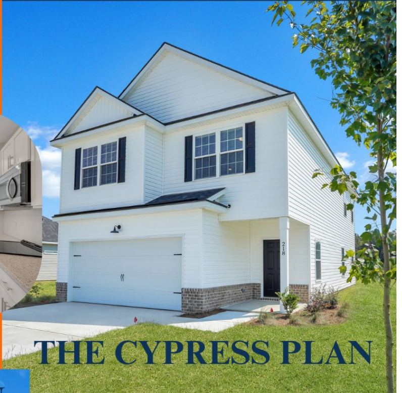
THE CYPRESS PLAN