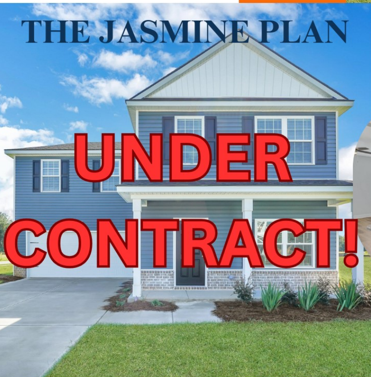
THE JASMINE PLAN